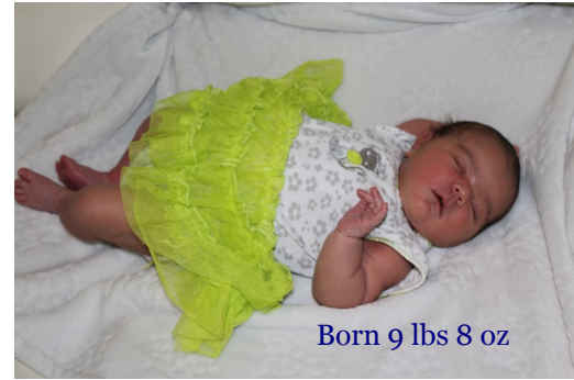
Born 9 lbs 8 oz

I am so excited to share with you all the news at Mary's Shelter! We have six women in our home and four babies. We are awaiting the arrival of two more babies any day. One of our residents gave birth to twin girls. This will be the first time we have had six babies in our home at the same time. We will need volunteers to assist us around the house as all our new mom's will be on "maternity leave" which means their main focus for the first two weeks after giving birth will be to bond with their new child. Household chores of cooking and cleaning will take a back seat as these new mom's help their infants to get their days and nights figured out, settle into routines and start to feel back to normal. If you are interested in helping us with household chores during this temporary period of time, please call us and we will get you on our schedule.